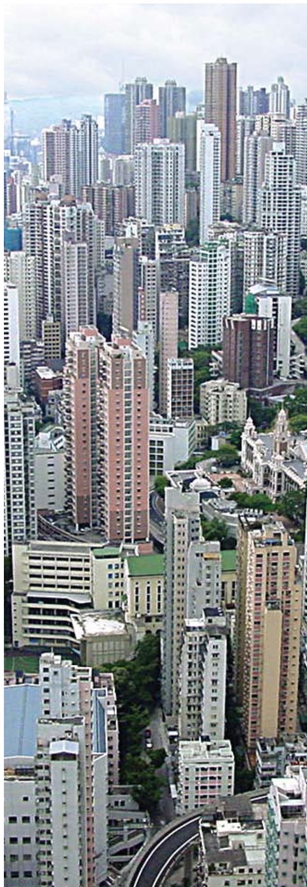
▶ Hong Kong

Improved coordination between the three levels of government – local, provincial and national – involves a change in the national and urban governance paradigm, in which central governments have the responsibility to put forward legislation, adopt social and economic policies and allocate budgets through a continuous dialogue with regional and local authorities in support of city growth. On their part, local authorities, working with regional authorities, need to develop clear visions and strategies that articulate short- and medium-term responses to enhance economic and social conditions in their cities. When local authorities set up good local governance structures for effective urban management and city development, and when they improve coordination with the other two levels of government, there are more chances to achieve harmonious regional and urban development. Economic and social policies need to address the needs of both cities and the regions in which cities are located, including urban-rural interfaces. If this is not done, it is likely that regional disparities will continue to widen.